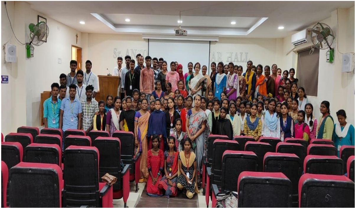
National Seminar on 15.09.2023