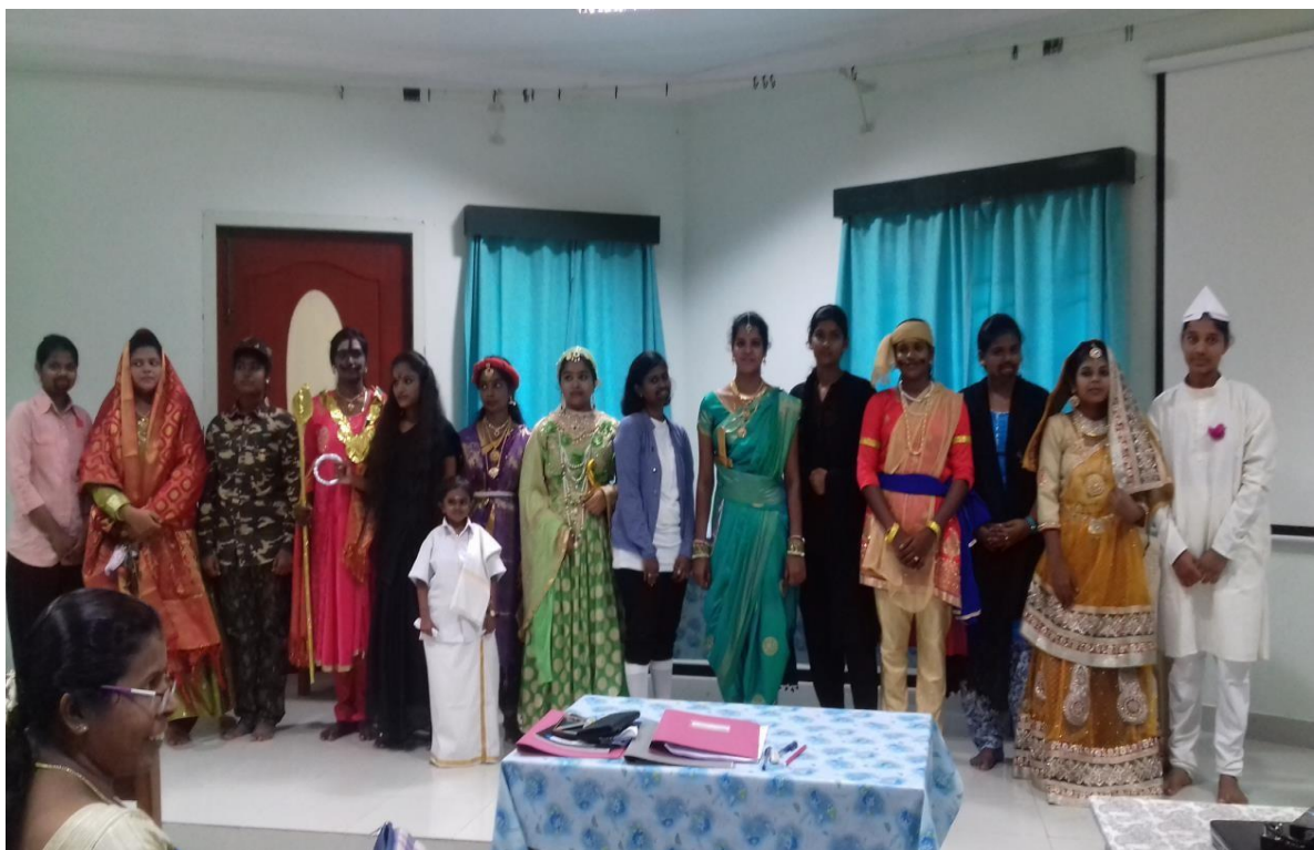
Exhibition on Sustainable Tourism Development on 25.01.2018