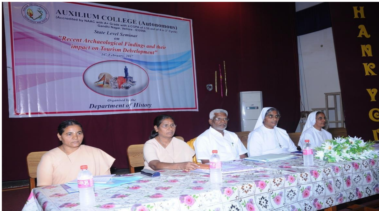
State-Level Seminar on "Recent Archaeological Findings and their Impact on Tourism Development" on 16.2.17