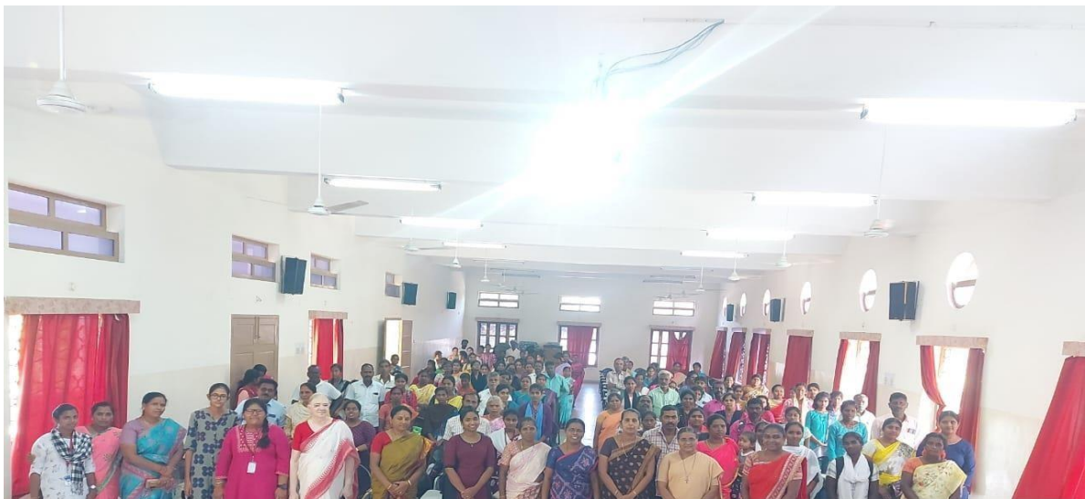
Parents Teachers Meet on 08.09.2023