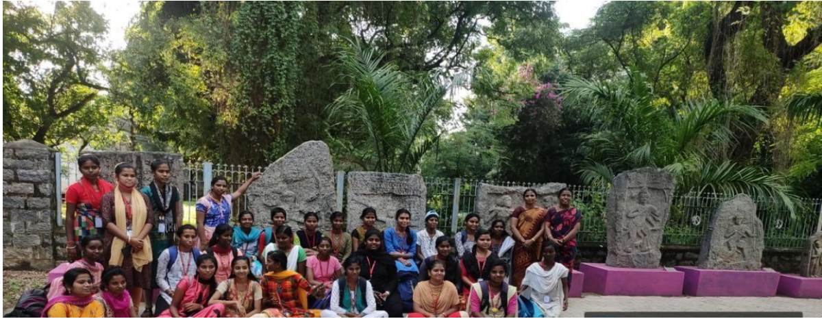
Field Visit to Vellore Museum on 12.10.2022