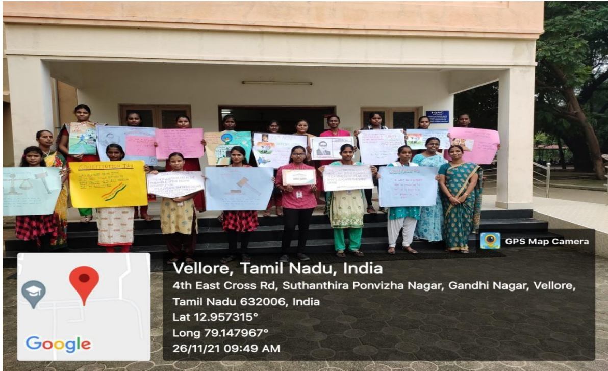
Celebration of Constitution Day-26.11.2021-Poster Presentation