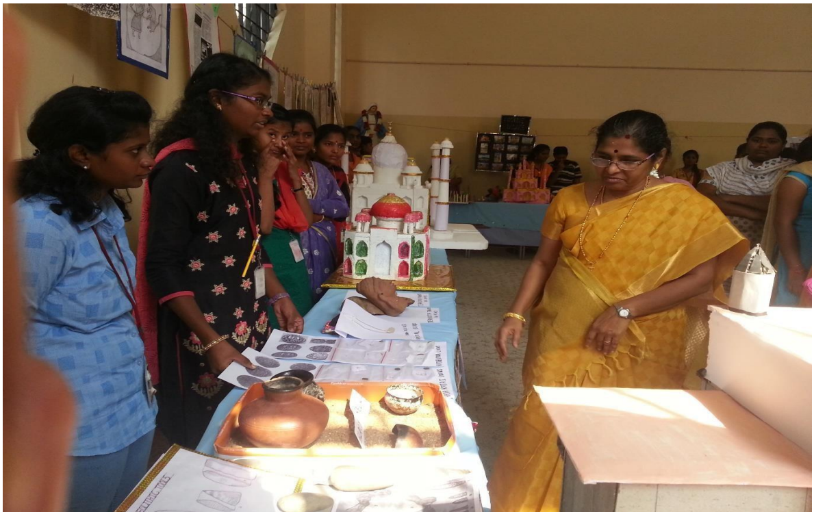
Historical Pageants Competition on 09.10.18