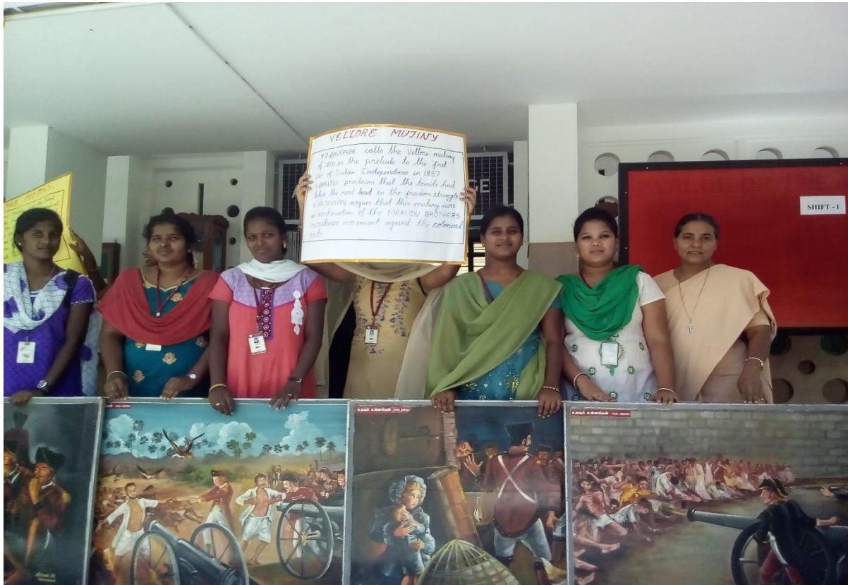
Commemoration of Vellore Mutiny on 10.7.17