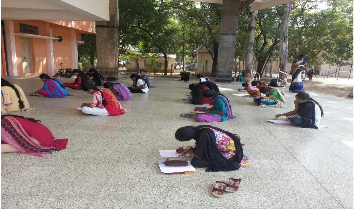
Inter-Departmental Essay writing competition on 22.1.2018